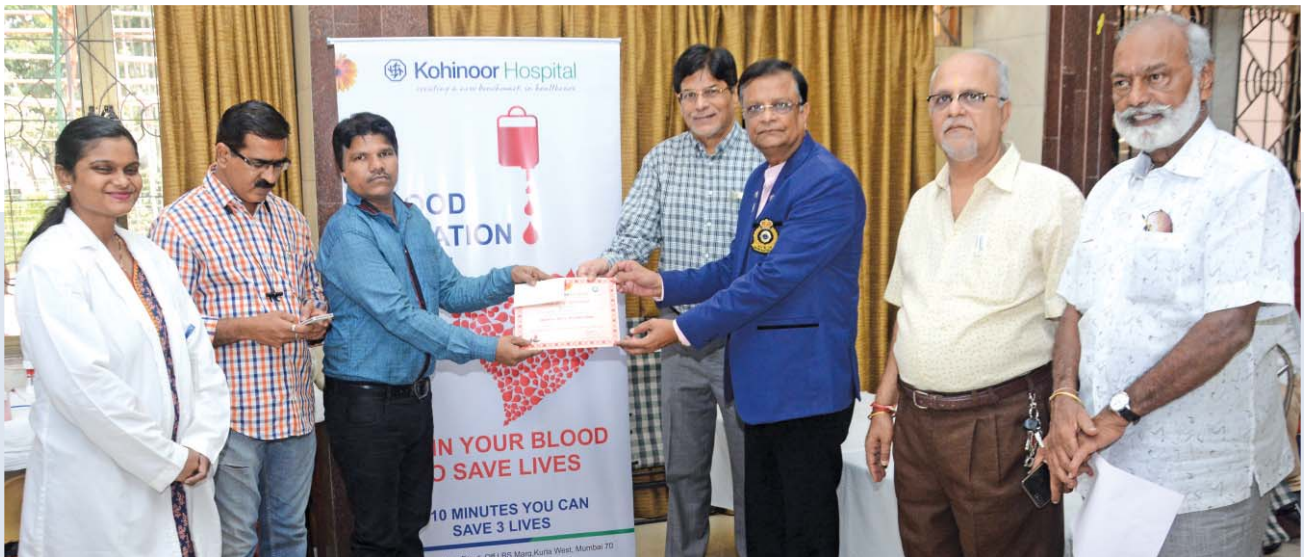
Handing over Certificate of Appreciation