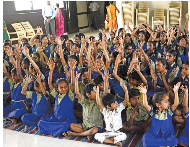
Enthusiastic Students after the Competition