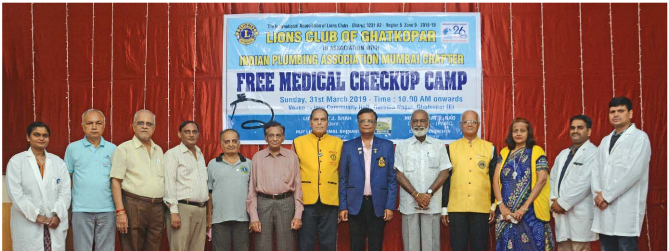
IPA MC Committee Members with Doctors at Medical Camp