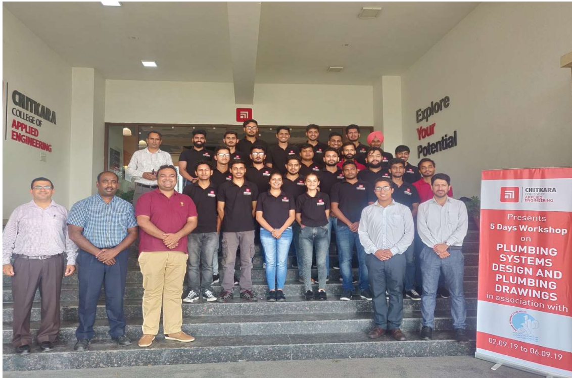
Figure 1: Successfully completed workshop on “Plumbing systems design & Plumbing drawings at Chitkara University in association with IPA Chandigarh chapter