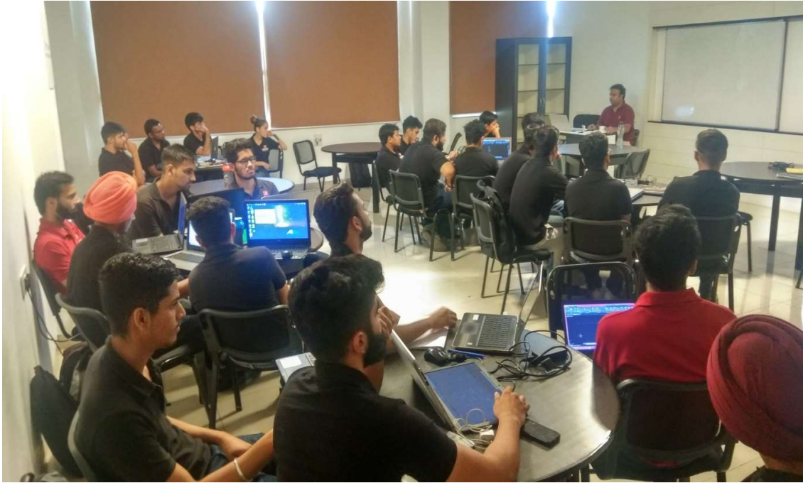
Figure 5: Designing plumbing systems using AutoCAD in given test projects