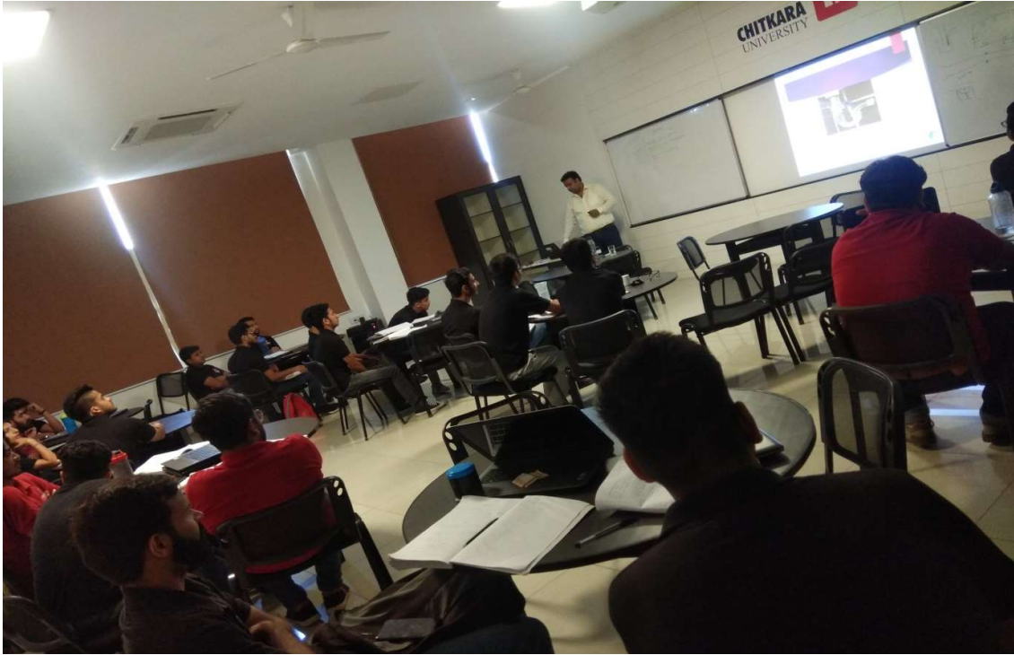
Figure 3: A still from expert lecture given by expert