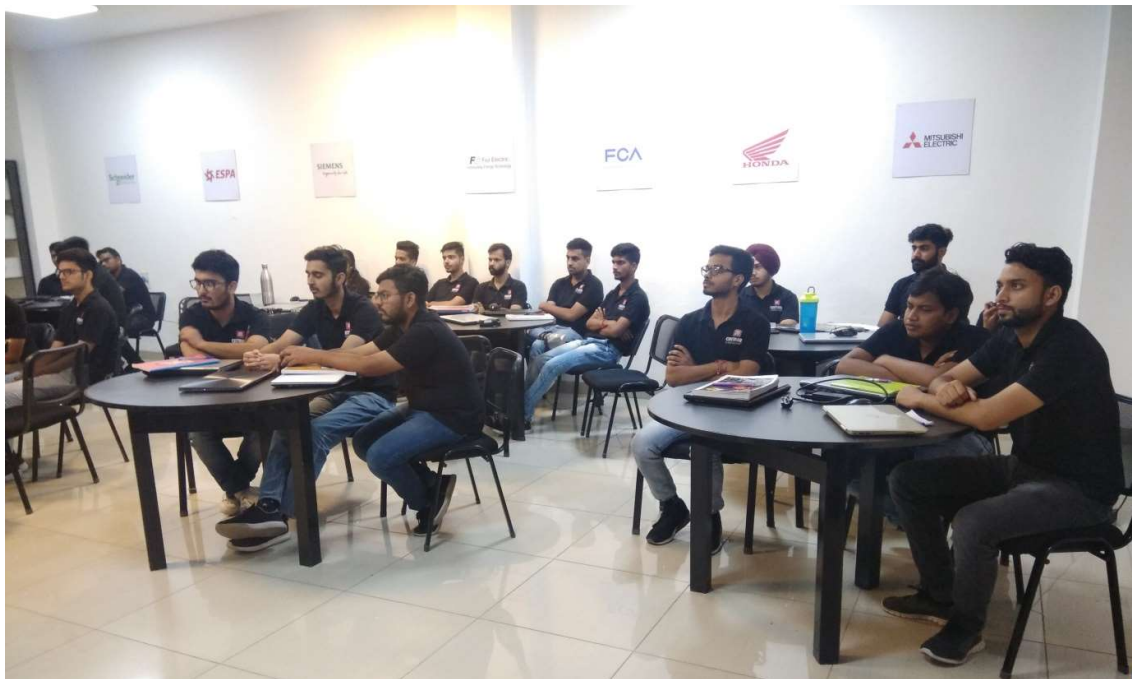
Figure 2: Exciting faces while getting up practical exposure by plumbing experts