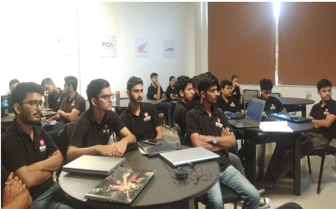
Figure 6: Wrapping up the workshop with important key points related to efficient plumbing works