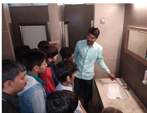
Students being given tips on DIYM Plumbing repair and maintenance work