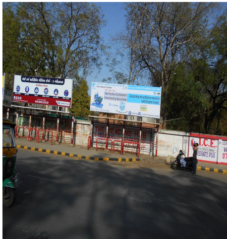
Off Cg Road - OS, St, Xavier College