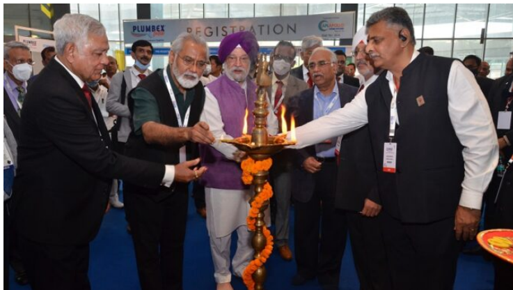
Hardeep Singh Puri launched Bharat Tap initiative & Nirmal Jal Prayas on the Inaugural Day of PLUMBEX India